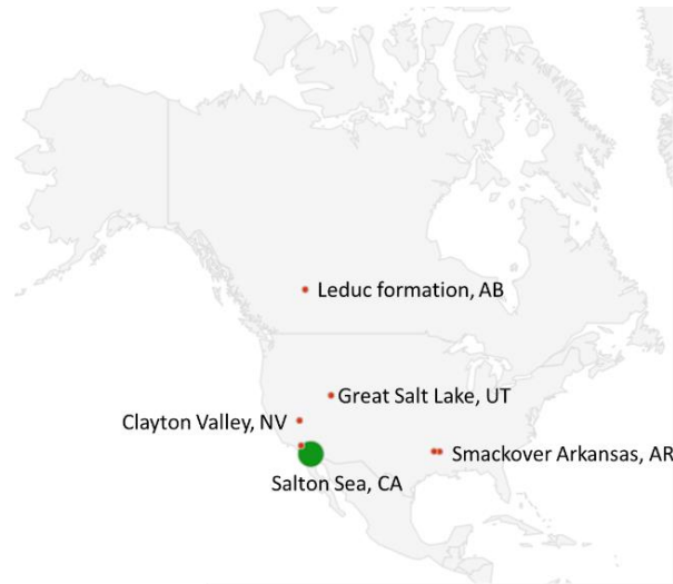
Figure 1 List of major lithium-containing brines in the United States and North America (reproduced from (Grant, 2019)) (Circle size indicates the number of companies in the location)

Two kinds of brine reserves exist in the United States and North America: geothermal brines, and other saline brines (termed as “non-geothermal” brines in the rest of this document). Figure 1 shows a list of major geothermal and non-geothermal brines in the US and North America (Grant, 2019).